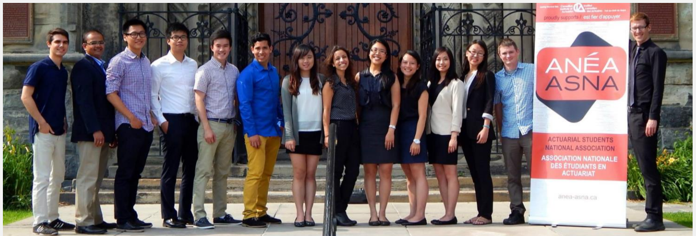
2014 - 2015 ASNA Committee

If you would like to learn more about this convention, you are more than welcome to drop by our office! You may also visit ASNA's official website http://www.anea-asna.ca/ for further details. We will be opening up registration in the coming months, so stay tuned!